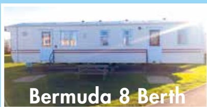
Bermuda 8 Berth