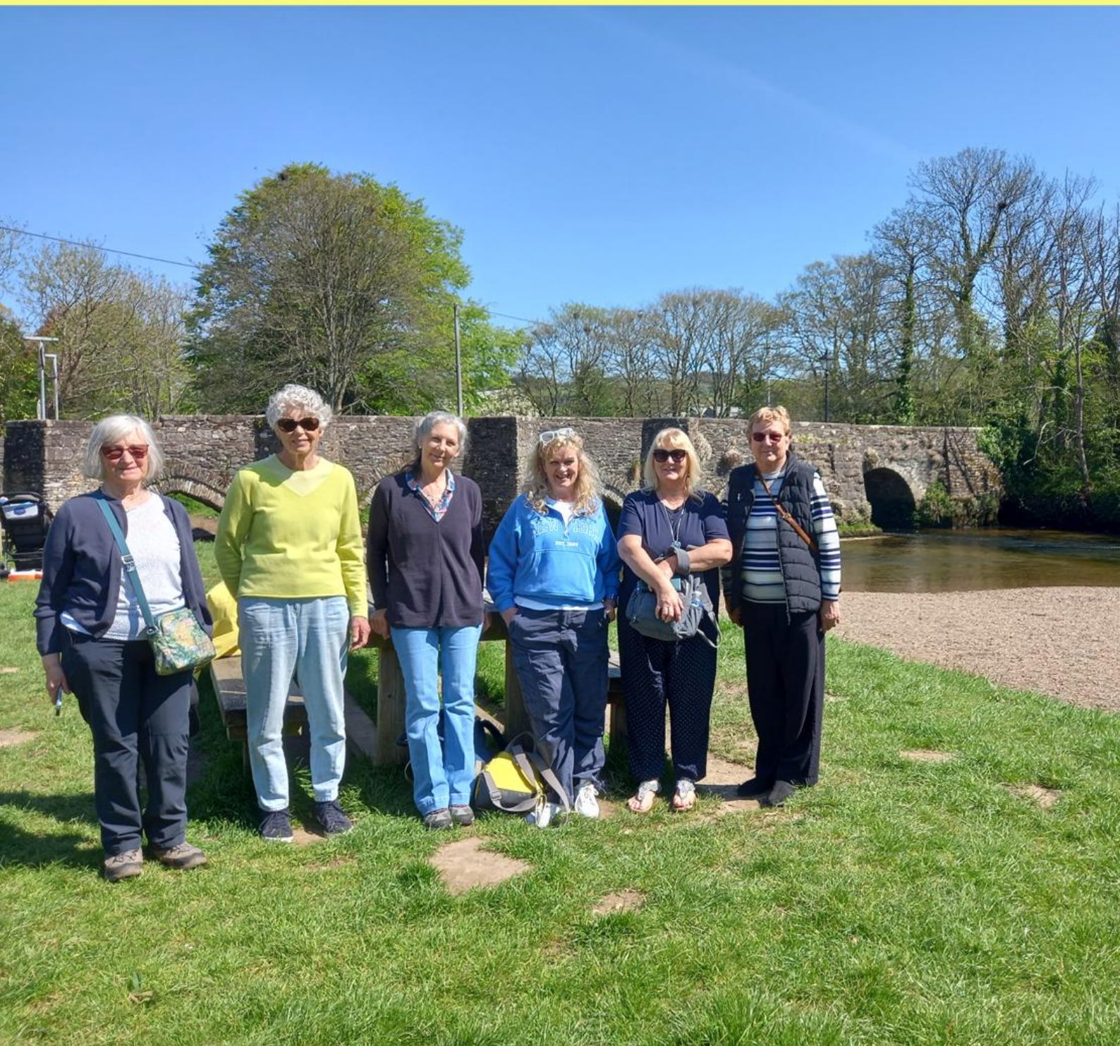
Members of Illogan WI, Zennor WI and Tregony WI on the April 2025 'Take a Town' event in Lostwithiel