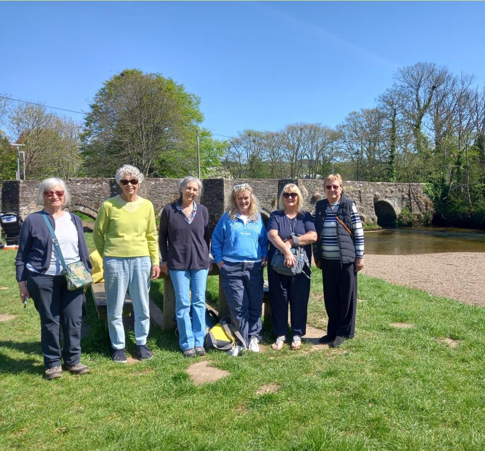
Members of Illogan WI, Zennor WI and Tregony WI on the April 2025 'Take a Town' event in Lostwithiel